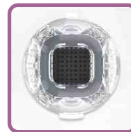
R-49 Needle Depth Control 0.1-4.0mm [0.1mm Step]

Needle is durable and also have high Biocompatibility by applying Gold Plating. Patient with Metal allergy could also use it with not concerning Contact Dermatitis.