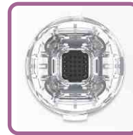
R-25 Gold Plating

Needle is durable and also have high Biocompatibility by applying Gold Plating. Patient with Metal allergy could also use it with not concerning Contact Dermatitis.