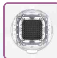
R-81 Safty Needle System/Needle Thickness: 0.2mm

Operate epidermis layer and dermis layer by controlling the needle depth in unit of 0.1 mm.