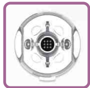
F-3x3 Eyes & Nose Area

The EmetrixPro applicator is a non-insulated treatment; it stimulates new collagen growth and resurfaces the skin by delivering bipolar RF energy. This treatment effects smoother skin and the reduction of facial wrinkles.