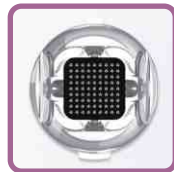
F-9x9 Body Area