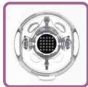
F-5x5 Face Area